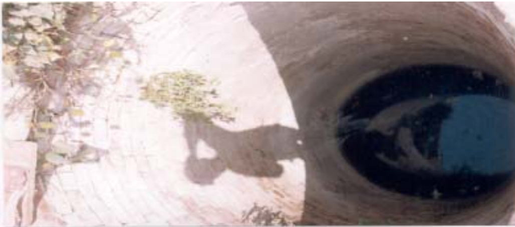
Polluted drinking water of a well unfit for human consumption due to mixing of sewage water in village Halluwas

The EE further stated (August 2004) that a proposal for acquiring 101 acres land for discharging sewage water was sent to the Government which was not approved due to paucity of funds.