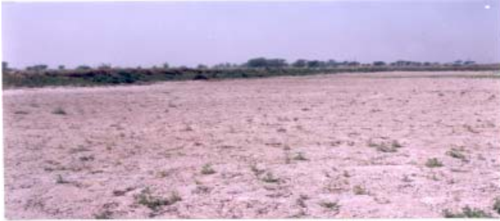
Agricultural land at village Halluwas rendered uncultivable as a result of sewage discharge in open fields