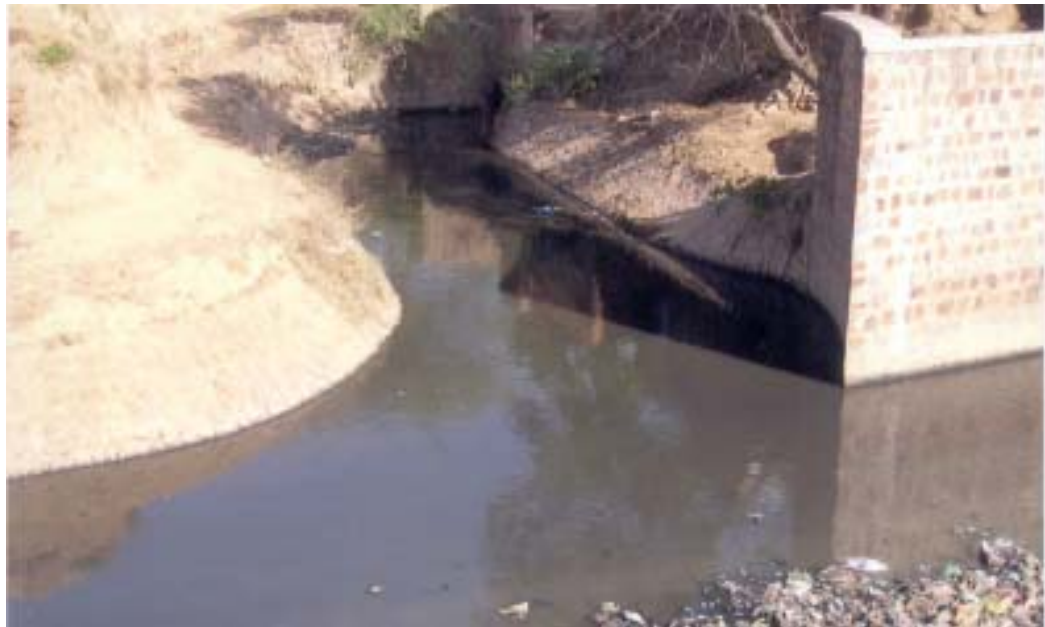
Effluent treated in STPs was not within prescribed standards

3.2.21 In Haryana, Yamuna Action Plan covers various towns including Faridabad. The waste water from Faridabad town was discharged into nalas , drains, (which ultimately reach river Yamuna) becoming the main cause of water pollution in the river. In order to prevent pollution of river in Faridabad area, GOI administratively approved (November 1993) a scheme, estimating the quantum of total sewage as 108.5 MLD, for construction of three STPs of 20 MLD, 45 MLD and 50 MLD capacity. The work of these STPs was completed between August 1998 and March 1999 at a cost of Rs 51.27 crore. However, 50 to 65 MLD sewage going untreated into Yamuna River through Movai Drain, Buria Nala and storm drains escaped the estimates and were not included while preparing detailed project reports.