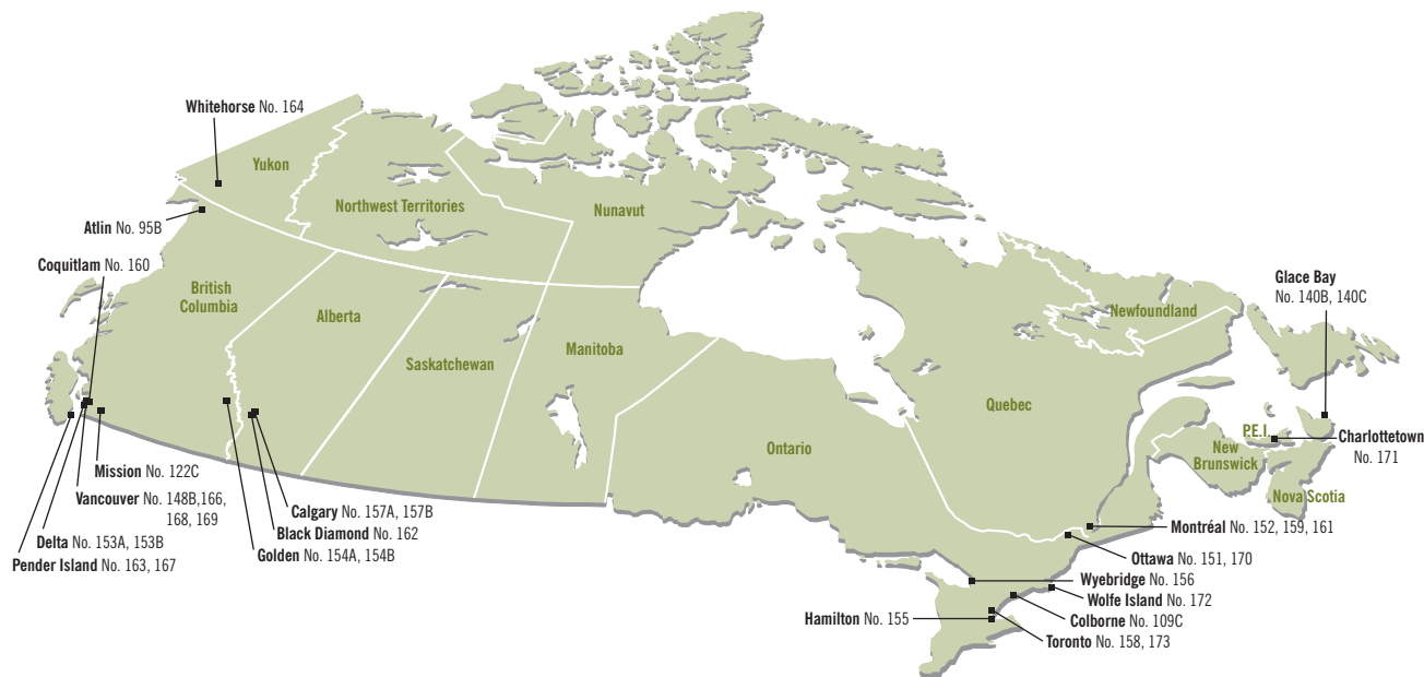
Exhibit 5.3 Petitions come from many parts of the country (1 July 2005 to 30 June 2006)