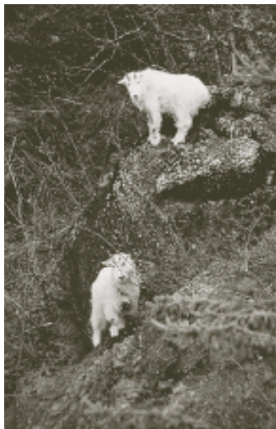
Mountain Goats near Banff, Alberta.

5.20 The laundry service company maintains that the allegations regarding the use of harmful chemicals are false. The Canadian Food Inspection Agency, which reports to Parliament through the Minister of Agriculture and Agri-Food, conducted an internal audit of the invoices that it received from this company to confirm the eligibility of payments made. The audit found that the “environmental charge” on several of the invoices was legitimate; however, certain invoices associated with a specific contract did include ineligible environmental charges. The internal audit determined that no ineligible charges were paid by the Agency. The Canada Food Inspection Agency has indicated that a summary of the internal audit that occurred as a result of the petition will be available on its Web site.