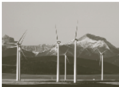
The PERR program purchases green power from the Castle River Wind Farm in Alberta.