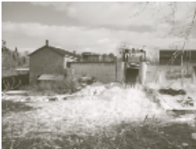
Energy Ottawa Green Power Generation Station, Victoria Island; Ottawa supplies power to the PERR program.

5.51 The PERR program is part of the Federal House in Order initiative intended to reduce the greenhouse gas emissions from the government's own operations by 31 percent by 2010—to show federal leadership in addressing climate change to other sectors of the economy and to the Canadian public. However, the federal government's existing approach for purchasing green power extends only to 2008–09, when the funding expires. Therefore, the continued contribution of the PERR program to reducing greenhouse gas emissions from federal government operations remains unclear. Furthermore, current spending restrictions resulting from the climate change review create uncertainty around the opportunities to enter into long-term contracts. Other potential means for developing future strategies for purchasing green power include the new federal Policy on Green Procurement and a national renewable energy strategy, currently under discussion by federal and provincial energy ministers.