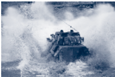
National Defence must train under realistic conditions but still comply with environmental protection legislation.

7.9 Like all government departments, National Defence must comply with federal environmental protection legislation—for example, the Fisheries Act , the Canadian Environmental Assessment Act , and the Canadian Environmental Protection Act (1999). Under the Canadian Environmental Assessment Act , the environmental impacts of proposed projects involving certain physical operations, construction, modifications, or other work must be assessed so that decisions can be made about how to proceed. However, National Defence is not required by the Canadian Environmental Assessment Act to do an environmental assessment each time it conducts routine military activities or when testing weapons on its designated land.