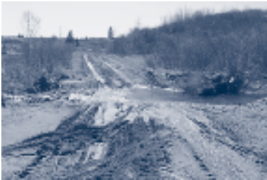
Erosion and damage to streams can affect fish habitat.

7.22 Erosion and silting of streams at Combat Training Centre (CTC) Gagetown in violation of the Fisheries Act . Silting because of land clearing activities in 1996 at CTC Gagetown affected a salmon spawning stream, contrary to subsection 35(1) of the Fisheries Act (see case study “Erosion at Combat Training Centre Gagetown shows lack of due diligence” on page 5). The activities would not have been contrary to that subsection if they had been authorized by the Minister of Fisheries and Oceans. However, there is no indication that National Defence obtained authorization for the work from the Minister of Fisheries and Oceans.