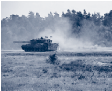
Routine training with heavy equipment like Leopard tanks has impacts on the environment.

7.75 Most training areas can sustain military training if appropriate mitigation and restoration measures are put in place. And the Range Training Area Development Plan can be used to help identify environmental stress and overused ranges. However, we found that the Plan has not yet been implemented—range training area plans that follow the July 2001 framework have not been completed.