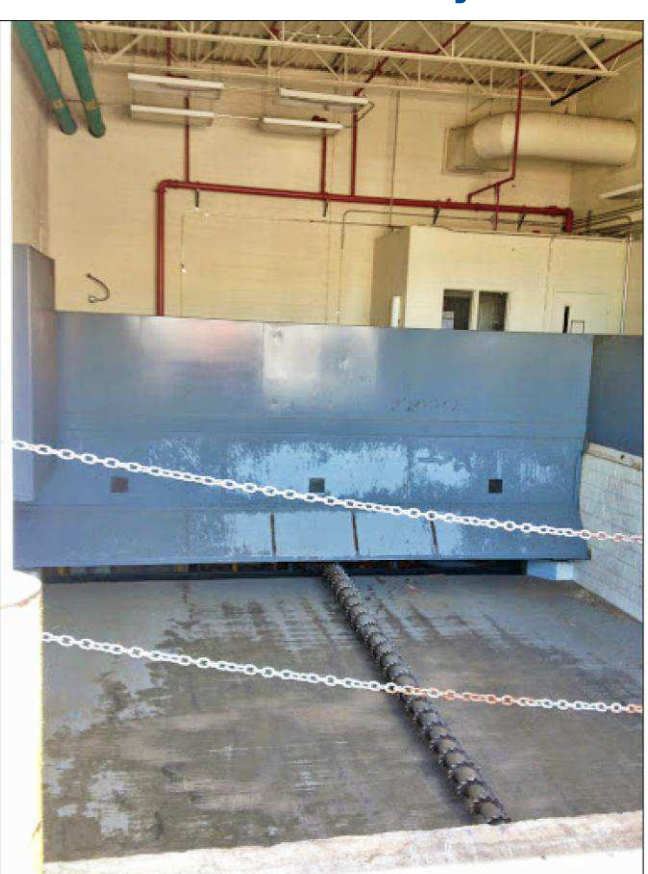
Components of the Department of Energy National Renewable Energy Laboratory's biomass ESPC project in Golden, Colorado.