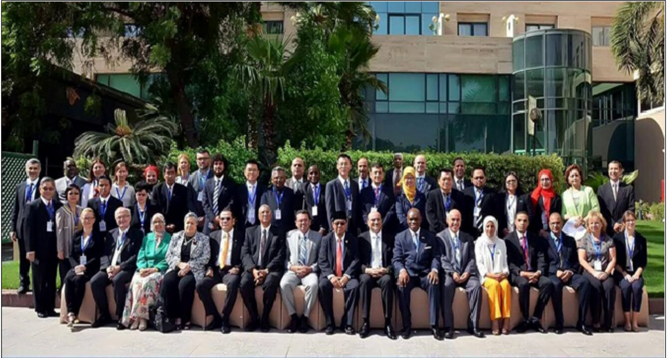
The Delegates of 14 th Steering Committee Meeting of WGEA in Cairo, Egypt