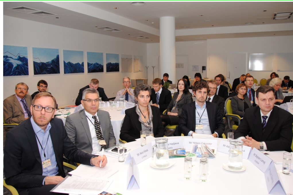
Participants at the 12<sup>th</sup> Annual Meeting of EUROSAI WGEA in Vilnius, Lithuania, in 2014.