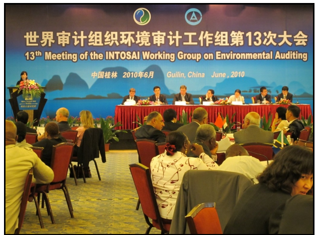
CNAO leading a discussion among WGEA delegates concerning Theme II of upcoming XX INCOSAI

work helped greatly to ensure the quality and accuracy of these translations. In accordance with INCOSAI procedures, the SAIs of Poland, Canada, Denmark, Philippines, Mexico, Algeria, Switzerland and South Africa will assume the roles of Vice-Chair, Moderators, Rapporteurs, Substitutes, and Technical Liaison. CNAO has been collaborating closely with these SAIs on Theme II preparation. Finally, CNAO acknowledges the more than 40 SAIs that have submitted country papers for this theme, laying a solid foundation for the CNAO Theme team's research.