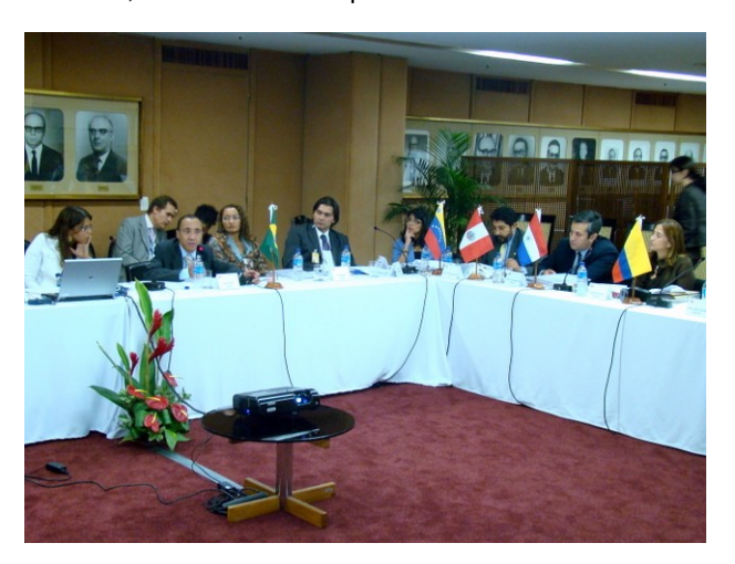
Group discussion among COMTEMA participants

The draft work plan approved by 6th meeting will be ratified by the members of COMTEMA at the next meeting, which is expected to be held in April of 2009. At that time, a new committee president will also be elected.