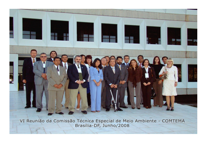
COMTEMA meeting participants at TCU main entrance

As the INTOSAI regional group representing the SAIs of Caribbean and Latin American nations, the Organization of Latin American and Caribbean Supreme Audit Institutions' (OLACEFS) stated objectives are to support scientific investigation; conduct training and promote specialization on topics of interest; and provide technical advice, assistance and coordination for the SAIs of Latin America and the Caribbean. OLACEFS's traditions date back to the 1960s, and it has existed under its current name since 1990.