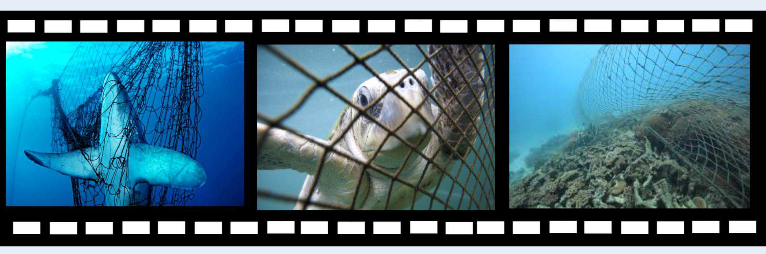
Infographic short movie