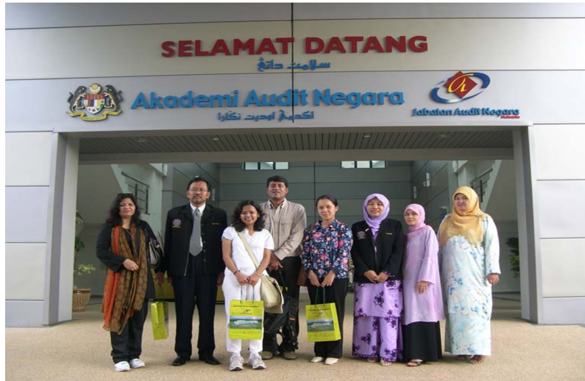
Auditors from China, India, Malaysia, Pakistan and Saudi Arabia