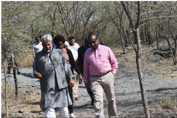
Field visit by the participants to TBS

community leadership in 2001” and “Stockholm Water Prize, also known as the Nobel Prize