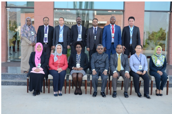
Participants with Director General, iCED

During the 15th Steering Committee meeting of WGEA, it was decided, that iCED would conduct an International Workshop on Audit of Water Issues for Audit Managers of SAIs. The WGEA has already issued guidelines on “Auditing Water Issues” in 2004 and 2013 and a research project on Marine Environment was taken up in currently concluded work plan 2014-16. The WGEA is also working on couple of research projects viz. Greening cities and Water Sanitation (Waste Water) in Work Plan 2017-19 where water is in the scope of the respective research projects. Hence, based on the further suggestions from the members of the Steering Committee of INTOSAI WGEA, a one week workshop, with an objective to provide a platform, to various SAIs for contributing and sharing their valuable knowledge and experience in the field of “Audit of Water Issues”, was organised at INTOSAI WGEA’s Global Training Facility the International Centre for Environment Audit and Sustainable Development, Jaipur from 19 to 23 February 2018. This International Workshop on “Audit of Water Issues” for Audit Managers of SAIs aimed at interaction on issues relating to water pollution, water scarcity and Resource Management, Drinking water and Sanitation, etc. Workshop was attended by 12 participants from 08 countries across the globe viz. Bhutan, Egypt, India, Lao PDR, Malaysia, Sudan, Thailand, and Zambia.