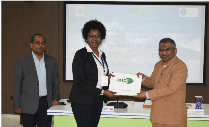
Director General, iCED conferring certificate of participation

mentioned the support extended by the Chair of INTOSAI WGEA, SAI Indonesia and senior